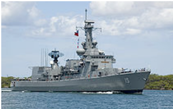
SHAWA (2010) 1/100 scale